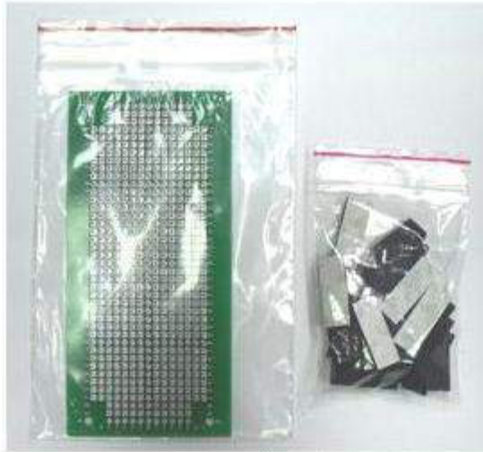
1.PCB / PCB STOPPER