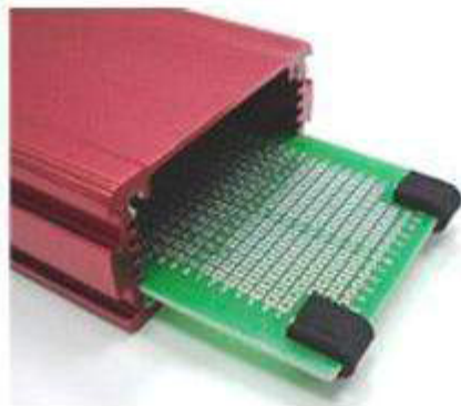
4.Insert the PCB into the extruded body.