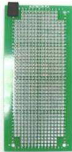
2.Remove the paper from the PCB STOPPER and affix the rubber on the hole of the PCB.